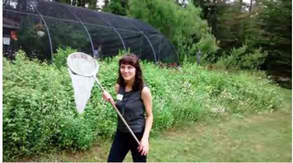
Paul Smith's College VIC Butterfly House