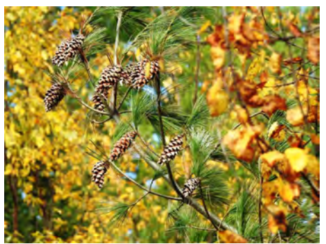
"The Arrival of Fall" by Laurel Fitts