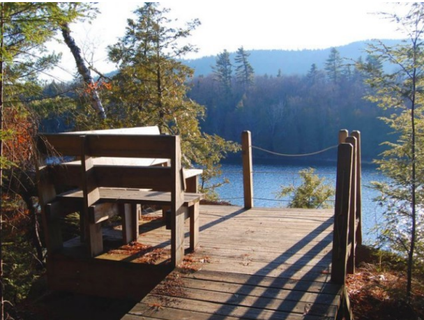
Rich Lake Outlook on the trails of SUNY ESF's Adirondack Interpretive Center.